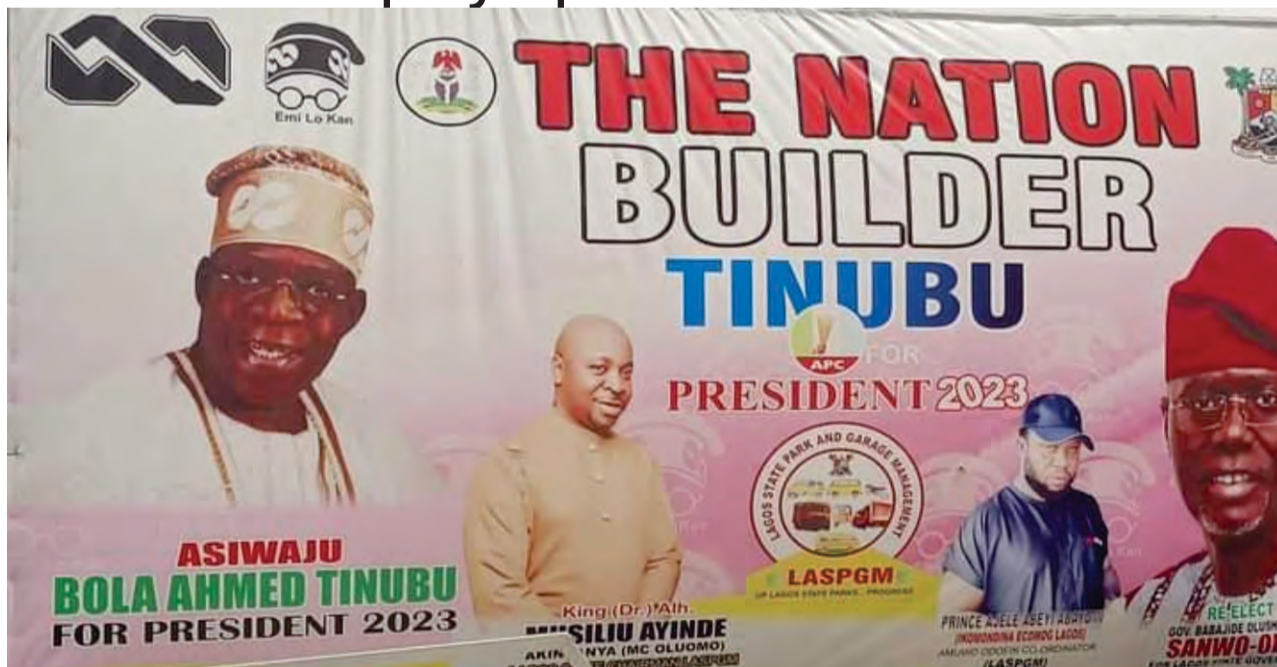
LASPGM fliers displayed along Lagos Badagry Expressway

in thorough consideration selected their preferred candidates based on their political achievements and