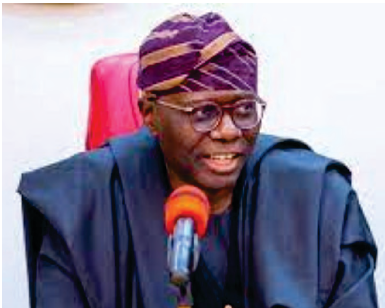
Gov. Babajide Sanwo-Olu

"We are hoping that their first plan is to have a production capacity of 5,000 vehicles, after which it will be pushed to 10,000 vehicles per year. We are happy with the level of work at the site and the commitment of our partner to this project. The plan is that we want to stop buying fully built vehicles from abroad; we want to be able to have an assembly line where we can employ our citizens in an automobile