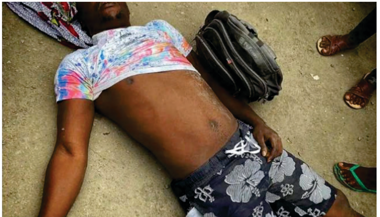
Corpse of the unidentified man