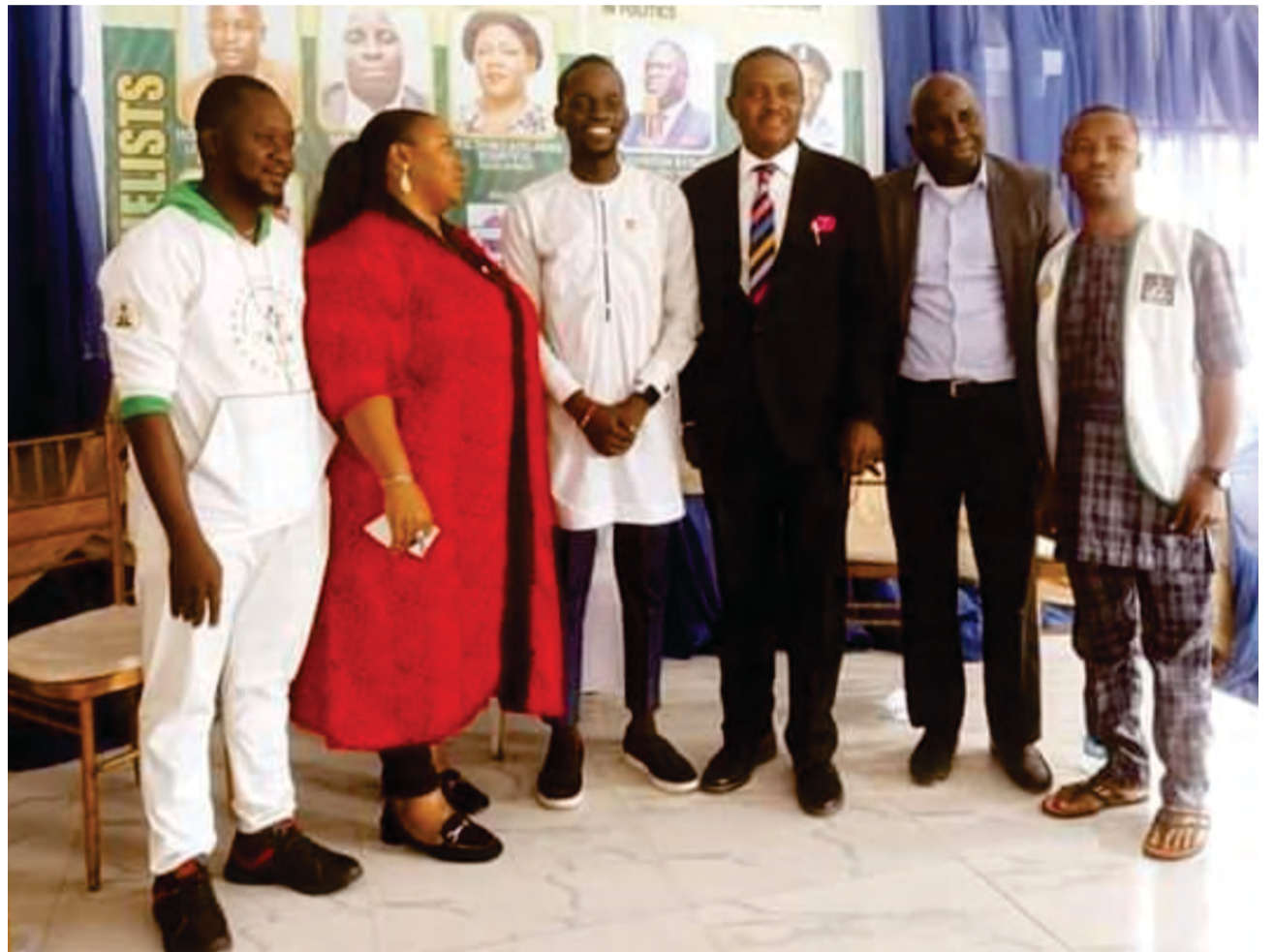
Agege NYCN Youths

He urged youths to be imaginative and think beyond their present, advising them to work towards realising their dreams.