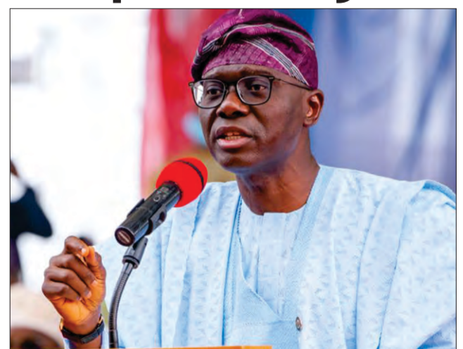
Gov. Babajide Sanwo-Olu

"To this end, I am further directed to inform you that the subject should be taught in primaries one and two and JSS one and two classes in the 2022/2023 academic session.