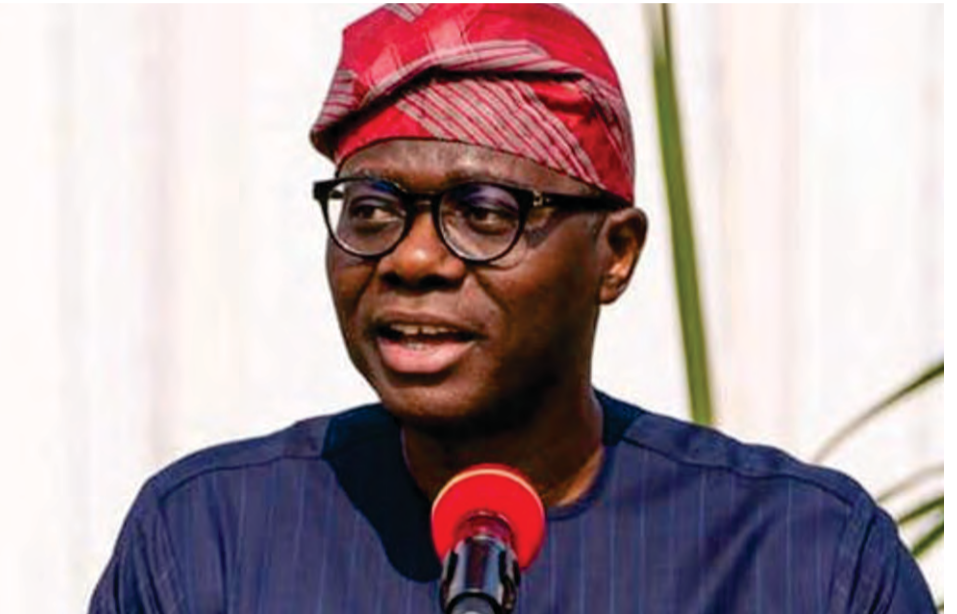
Gov. Babajide Sanwo-Olu

The governor said: "They are waiting on us to clean up and ensure the Timber ville is fully habitable for them. In terms of agreement with the saw millers, they have shown their readiness to relocate. We have the full political will to ensure this relocation is done, but we don't want to throw our citizens into a place that is not fully ready.