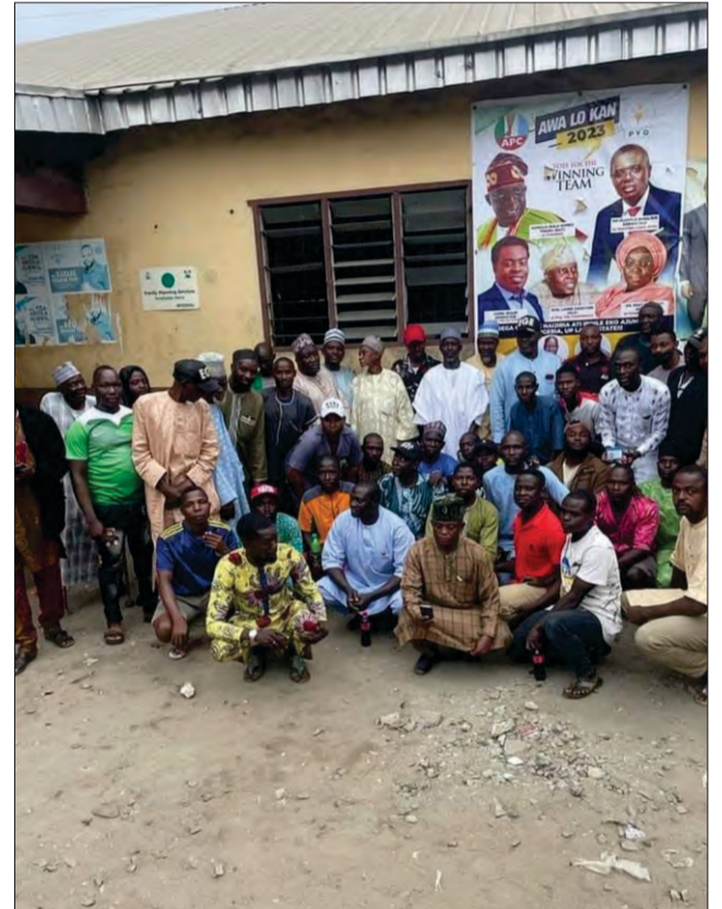
Picture of political youths in Iba LCDA

He assured them that such opportunities will be channelled through the youth structure, adding that meeting attendance will be considered before dishing out any opportunity given to the youths henceforth.