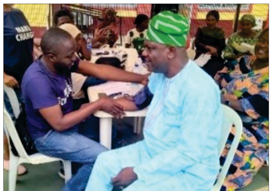
Residents getting free medical services in Ikorodu LG