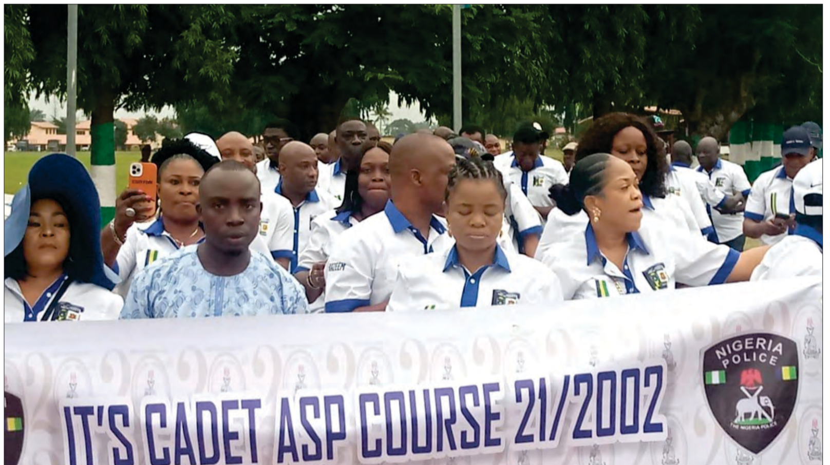
Cadet ASP Course 21/2002 celebrating 20th anniversary in Lagos