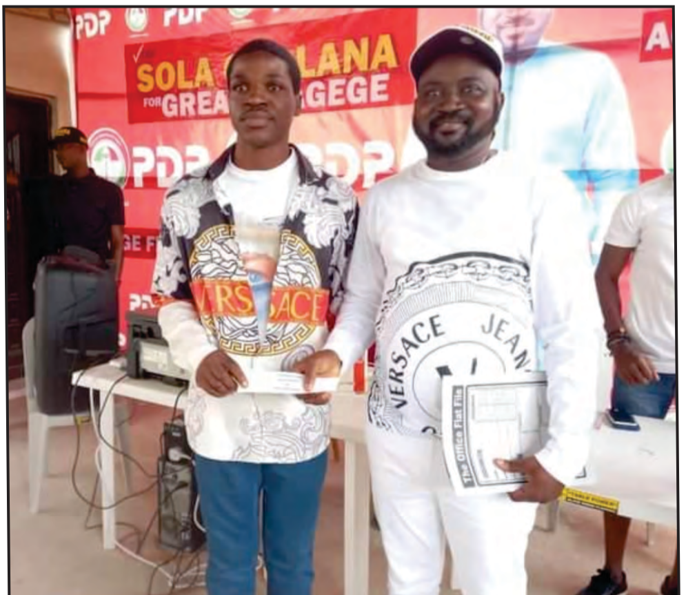
Beneficiaries holding their forms