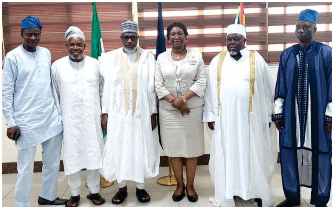
LASU Vice Chancellor in a group picture with religious clerics

of joy." He encouraged all students to emulate the philosophy the university has laid down, which he said will be a source of relationships with people when they venture into the world. He further prayed for the safety of the institution, Lagos State and the nation at large.