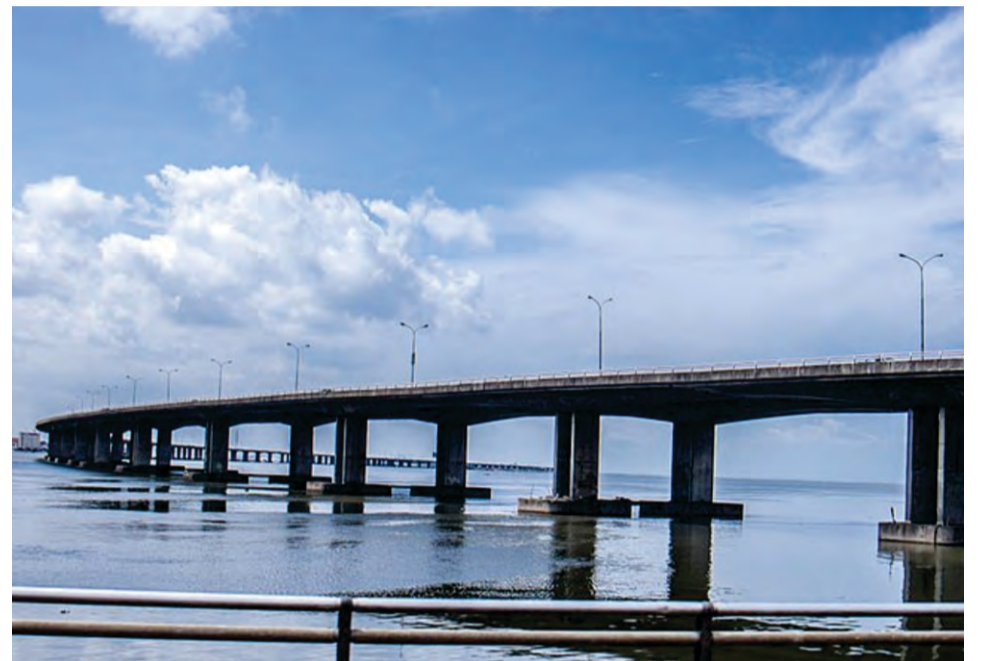
Third mainland bridge

Road users in Lagos whose areas are yet to be reached are advised by the General manager that their turn would come shortly.